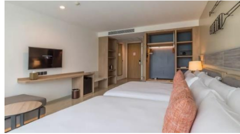
Deluxe (Garden View) : 40-square-metre