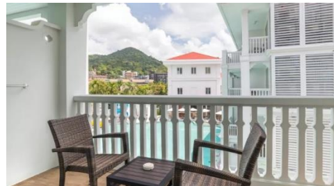
Premium Deluxe (Pool View) : 49-square-metre

Room rates are inclusive of daily buffet breakfast.