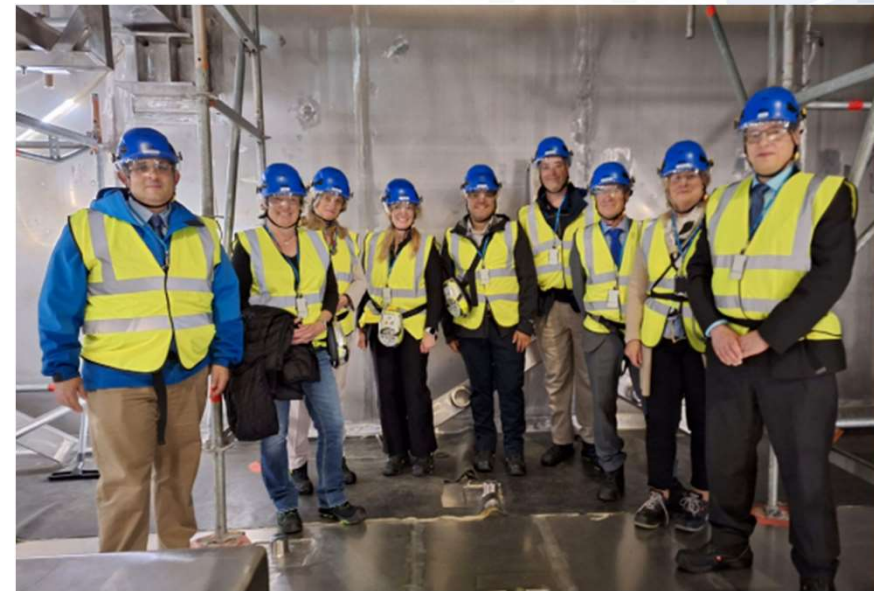
Participants of IS WG meeting had the possibility to continue to Final Disposal WG meeting in Olkiluoto and visit ONKALO, the soon operating deep geological repository for spent nuclear fuel